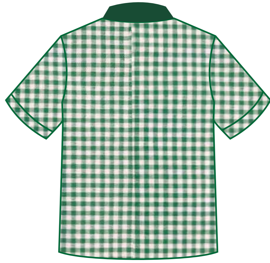
Shirt Back Face