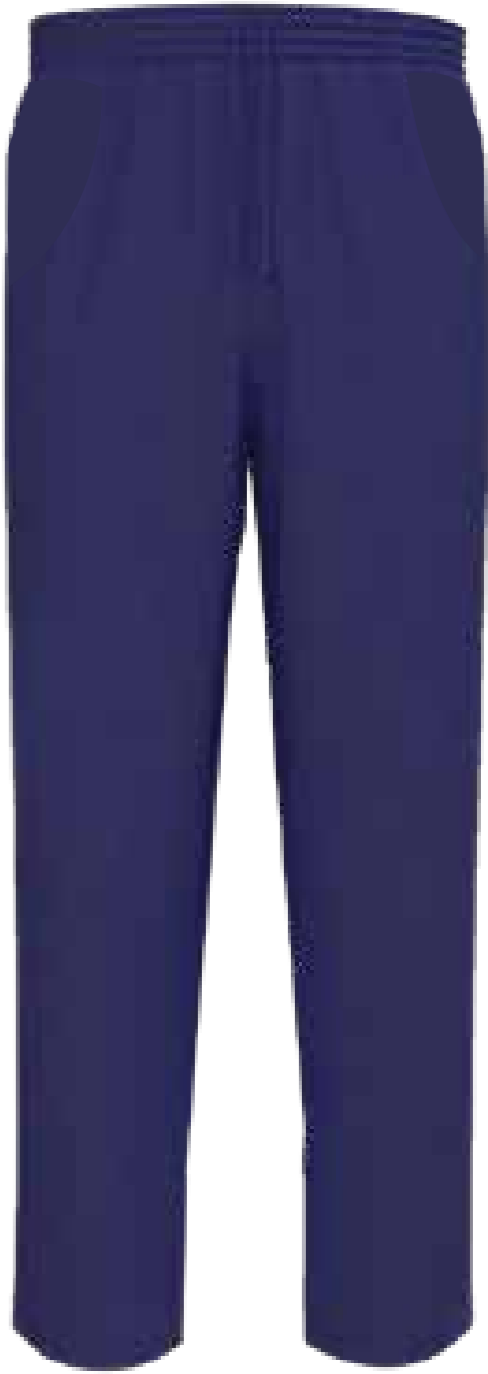
PANT SIDE AND FRONT