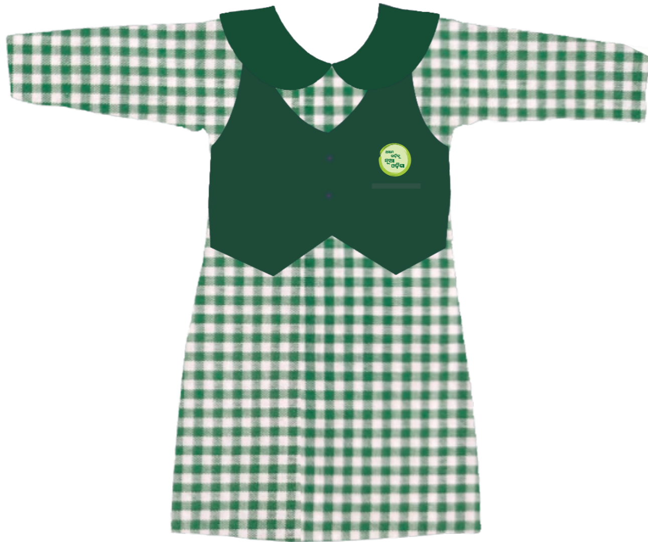
Shirt Front Face