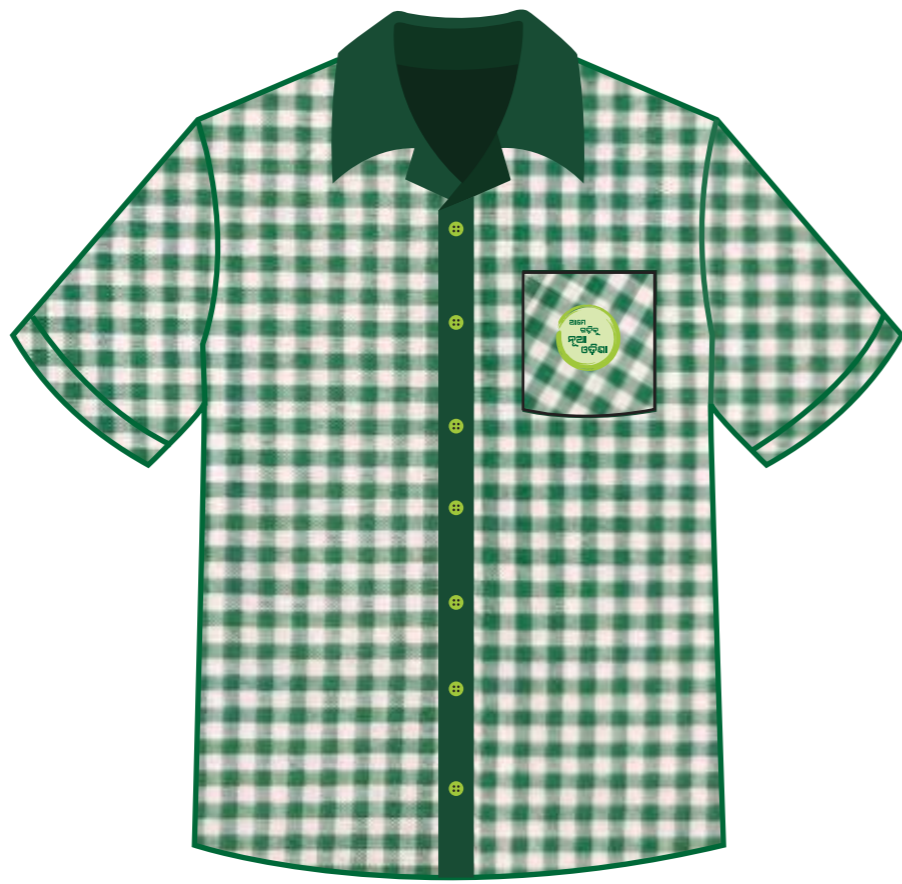
Shirt Front Face